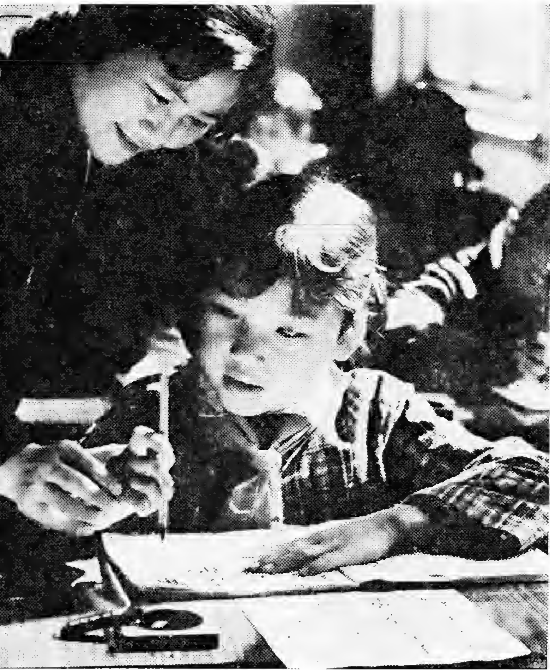
A third-grader learns writing with a brush.